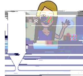
Former Academy Participant, BUS